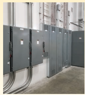
MGS Clean Room Steiner Electric, Inc.