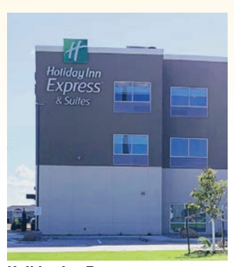
Holiday Inn Express WDS Construction, Inc.