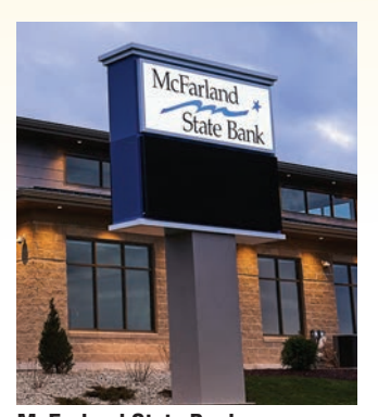
McFarland State Bank KSW Construction