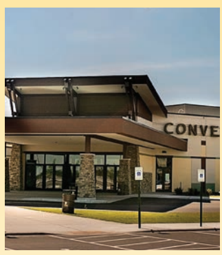
Kalahari Conference Center Expansion / Friede & Associates