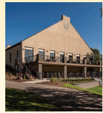
Glen Erin Golf Club Banquet Hall Gilbank Construction, Inc.