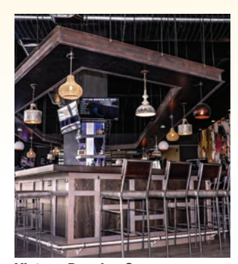
Vintage Brewing Company - Capitol East / Friede & Associates