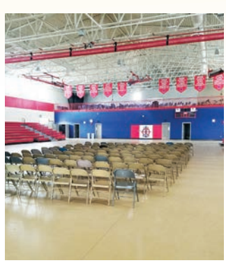
Des Lacs High School Consolidated Construction Co., Inc.