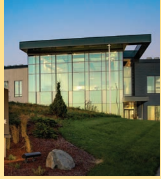
Illumina - New Research Facility Faith Technologies, Inc.