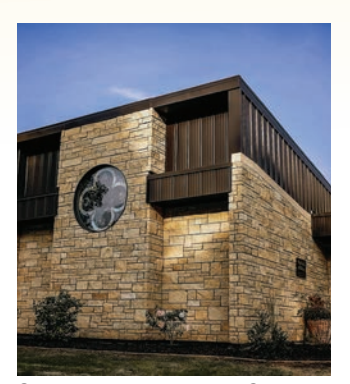
Sacred Heart Adoration Chapel