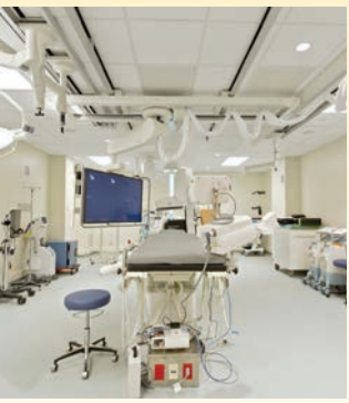
Saint Michael's Hospital - Nuc Med/Cath Lab / Ellis Construction