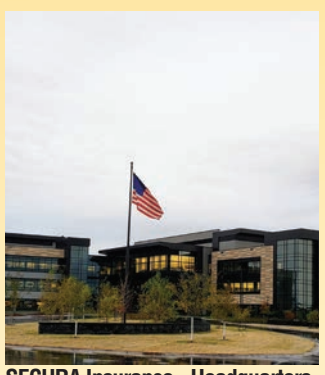
SECURA Insurance - Headquarters Faith Technologies, Inc.