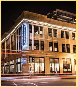
Hotel Goodwin | Velvet Buffalo Cafe / Corporate Contractors Inc.