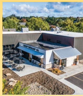
Hatch Distilling Company Keller, Inc.