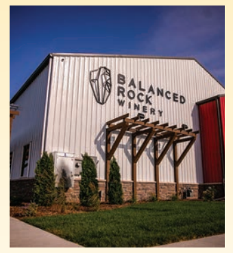
Balanced Rock Winery Friede & Associates