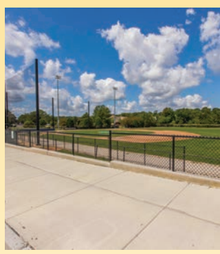
Frame Park Ford Construction