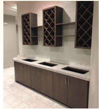
Sundara Renovation Holtz Builders, Inc.