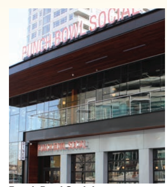
Punch Bowl Social WDS Construction, Inc.