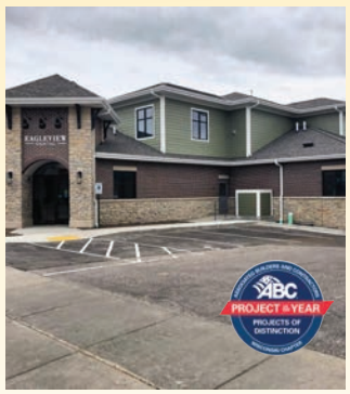
Eagleview Dental Keller, Inc.