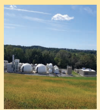
Dane County BioGas Facility Joe Daniels Construction Co., Inc