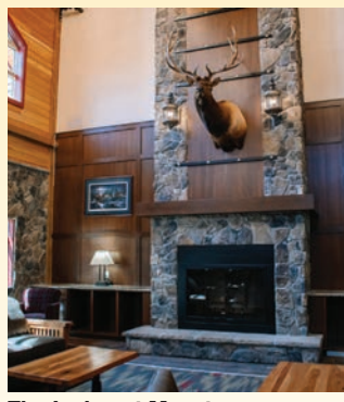
The Lodge at Mauston JKC, LLC