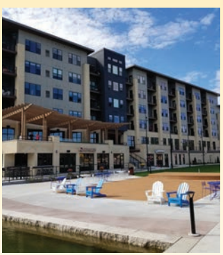
The Current McGann Construction