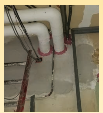
Milwaukee City Hall 3rd floor renovation / Alpha Insulation and Waterproofing, Inc.