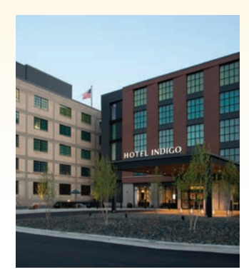
Hotel Indigo Stevens Construction Corp.