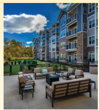
The Oaks of Shorewood Stevens Construction Corp.