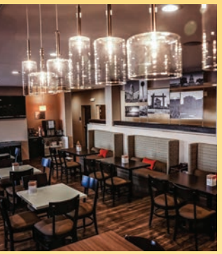
Sleep Inn Friede & Associates