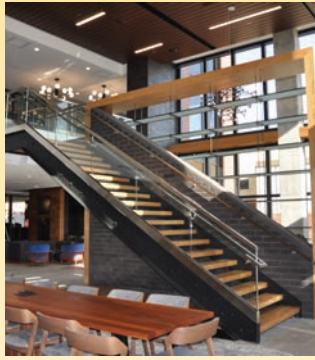
Springhill Suites Kraemer Brothers