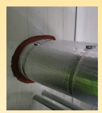
Froedtert Hospital Vertical Expansion / Alpha Insulation and Waterproofing, Inc.