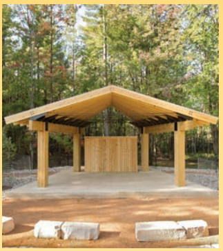
Schmeeckle Reserve - Amphitheater Development / Ellis Construction