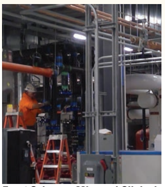
Exact Sciences Mfg. and Clinical Science Building / North American Mechanical, Inc. (HVAC)