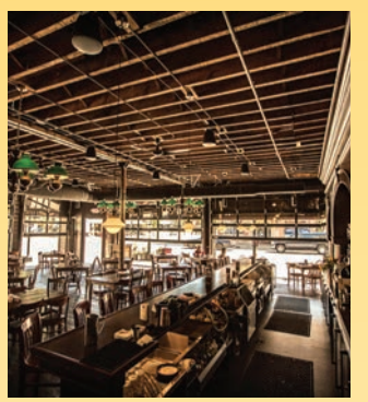
Truk't | Blue Collar Coffee Corporate Contractors Inc.