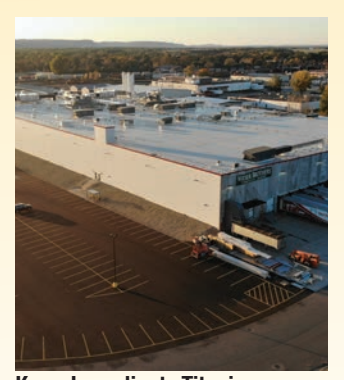
Kerry Ingredients Titanium Project / Steiner Electric, Inc.