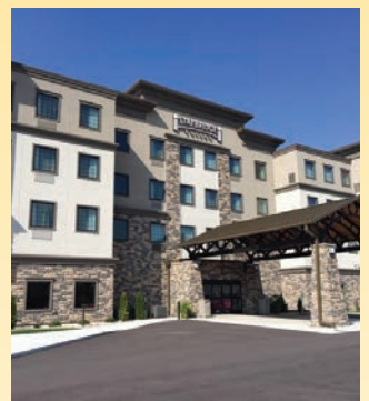
Staybridge Suites Holtz Builders, Inc