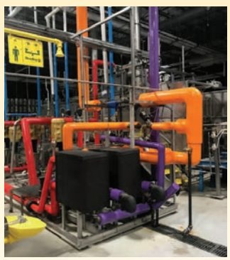
MicroStar Logistics Performance Firestop