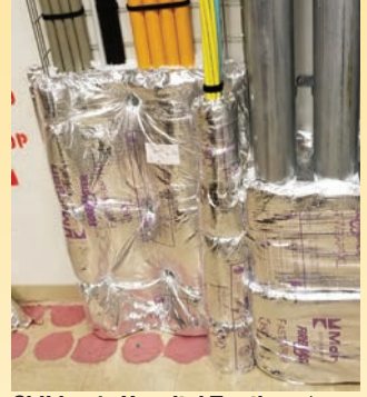
Children's Hospital T-ratings / Alpha Insulation and Waterproofing, Inc.