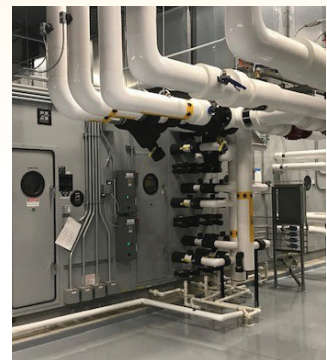
Exact Sciences Mfg. and Clinical Science Building / North American Mechanical, Inc. (HVAC)