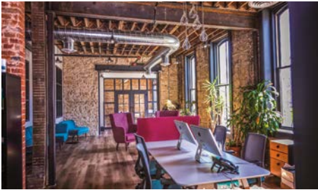
Wisconsin English Second Language Institute (WESLI)—Madison, WI Gold Award: Restoration & Renovation