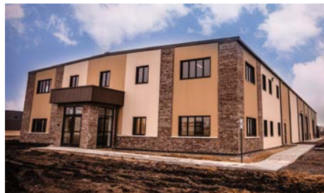
R.G. Heating—Waunakee, WI Silver Award: Pre-Engineered Building – Metal Building $1 Million to $2.5 Million