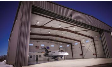
S&L Companies Hangar—Baraboo, WI Silver Award: Pre-Engineered Building – Metal Building $1 Million to $2.5 Million