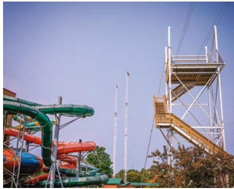
Chula Vista Zipline & Ultimate Rush Accelerator Ride—Wisconsin Dells, WI Silver Award: Miscellaneous/Special Projects