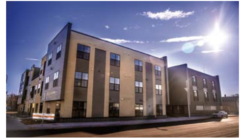
Walnut Street Flats—Reedsburg, WI Silver Award: Residential – Multi-Unit