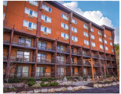
Chula Vista North & South Tower Renovation—Wisconsin Dells, WI Silver Award: Restoration & Renovation