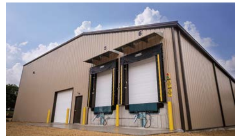
Bardo Custom Blending—Elroy, WI Silver Award: Pre-Engineered Building – Metal Building $1 Million to $2.5 Million