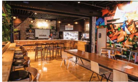
Young Blood Beer Co./Plain Spoke Cocktail Co.—Madison, WI Gold Award: Restoration & Renovation