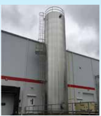
Masters Gallery New Plant HVAC & Refrigeration / Rohde Brothers, Inc.