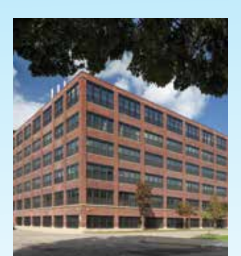
Welford Sanders Lofts and Enterprise Center / Catalyst Construction