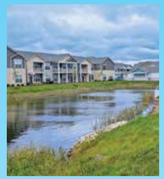
Springs at Sun Prairie Wondra Construction Inc.