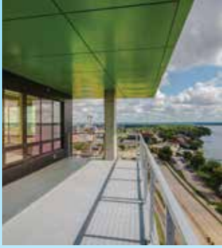
151 East Wilson Stevens Construction Corp.

For the eighth consecutive year, the "Built on Merit" Award was presented to Friede & Associates for using the highest number