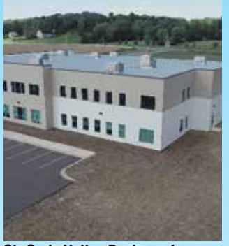
St. Croix Valley Business Innovation Center / Ross & Associates, Ltd.