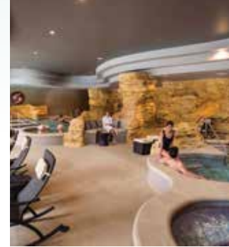
Sundara Spa / Neuman Pools, Inc.