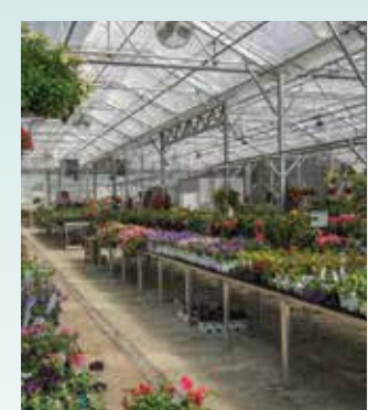
Klein's Floral & Greenhouses Supreme Structures