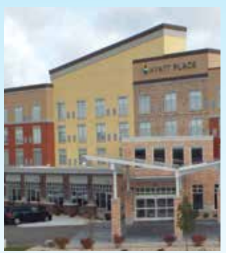
Hyatt Place Hotel KSW Construction