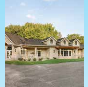
Welcome Center / Altmann Construction Co. Inc.