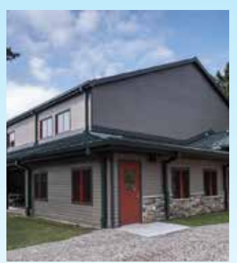
Camp Gray The Ark - Gymnasium Holtz Builders, Inc