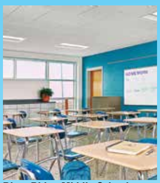
River Ridge Middle School Addition / Kraemer Brothers