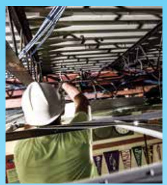
Delavan-Darien School District – Energy Efficient Lighting Upgrades / Faith Technologies, Inc.