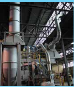
Skana Aluminum Co. Cast House Expansion / A.C.E. Building Service