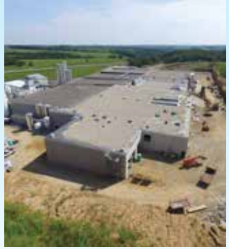
Klondike Cheese Company Addition / Kraemer Brothers