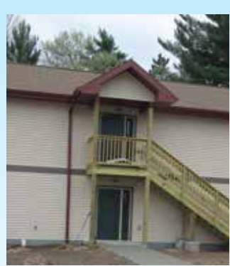
Chula Vista Resort Employee Housing / Friede & Associates