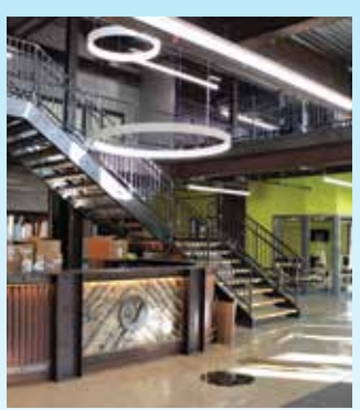
Stateline Family YMCA Corporate Contractors, Inc.