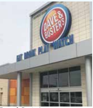
Dave & Buster's WDS Construction, Inc.