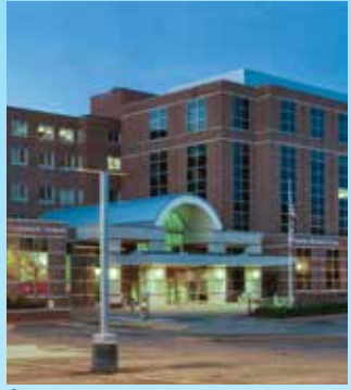
St. Michael's Hospital -Emergency Department / Ellis Construction