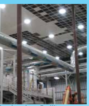
Duraform Lane Facility North American Mechanical, Inc.