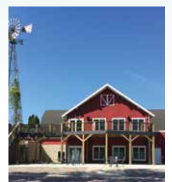
Vennebu Hill Wedding Barn & Event Venue / KSW Construction