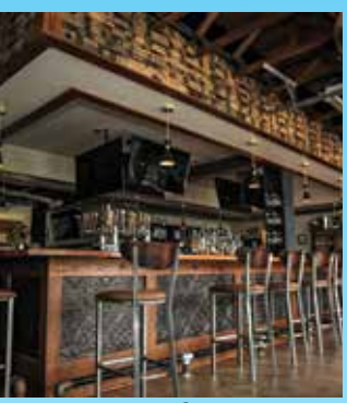
Vintage Brewing Company Friede & Associates