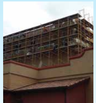
Chula Vista Resort Fire Restoration / Friede & Associates