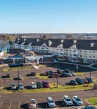
Shorehaven. Health Center-Wellness Residences / Altius Building Company