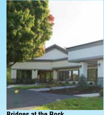
Bridges at the Rock WDS Construction, Inc.