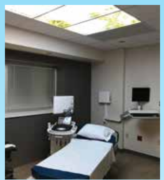
St. Michael's Hospital -Breast Center / Ellis Construction