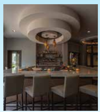
Sundara Addition Holtz Builders, Inc.