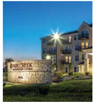
Park Creek Independent Living Consolidated Construction Co., Inc.