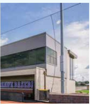
UW-Whitewater Athletic Complex Buildings / Gilbank Construction, Inc.