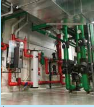
Great Lakes Energy Education Center, Northeast Wisconsin Technical College / Performance Firestop, Inc.