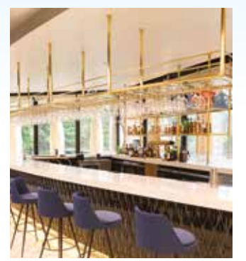
Muse at Sentry Ellis Construction