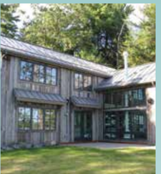
Big Fork Retreat Design/Build by Visner