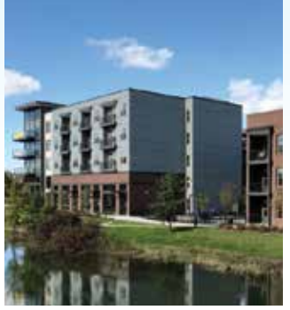
The Marling Stevens Construction Corp.