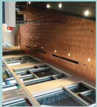
Confluence Art Center / Master Metals Inc