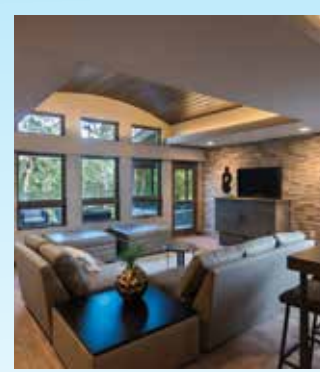
Sundara Woodland Retreats Friede & Associates