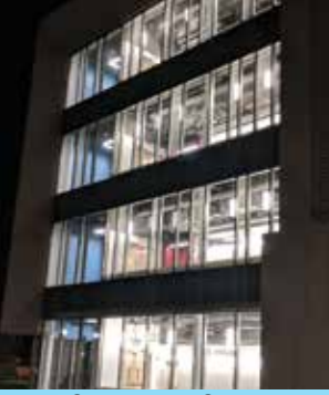
UW LaCrosse New Science Lab Building / North American Mechanical, Inc.