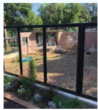
Ochsner Park Otter Exhibit Friede & Associates