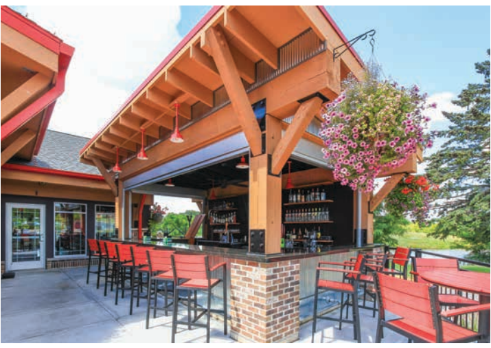
The new Monk's at The Wilderness outdoor bar and dining area was completed just in time for the 4th of July holidays. The Wisconsin Dells project also included closing in and finishing the former outdoor dining area and opening it up to the existing dining area, substantially increasing the indoor dining space for customers who frequent the popular bar and grill.